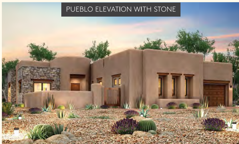
PUEBLO ELEVATION WITH STONE